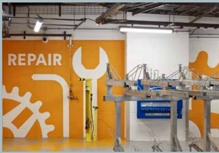
EightyFen / End of Journey Facilities