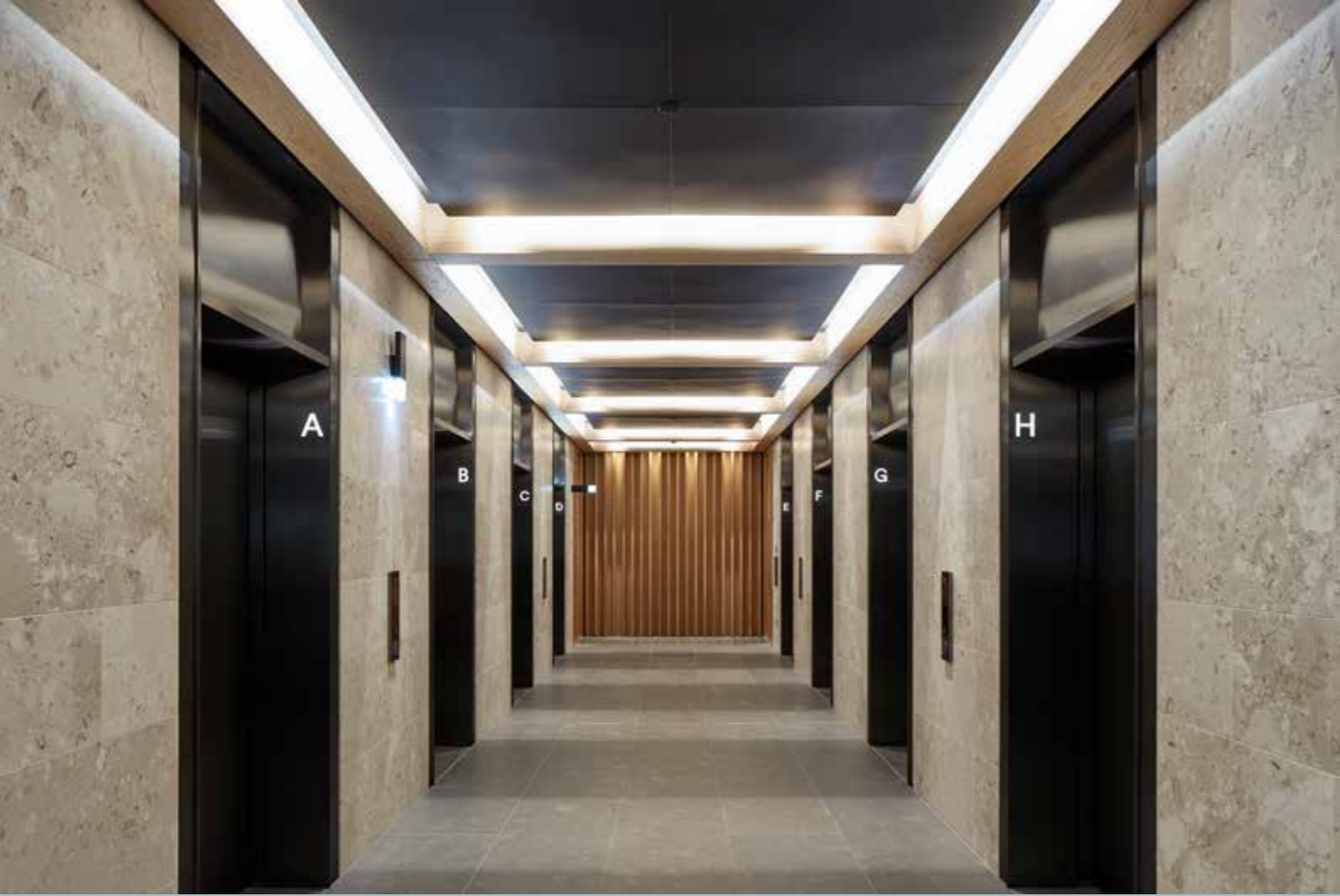
Eighty/Fen / End of Journey Facilities